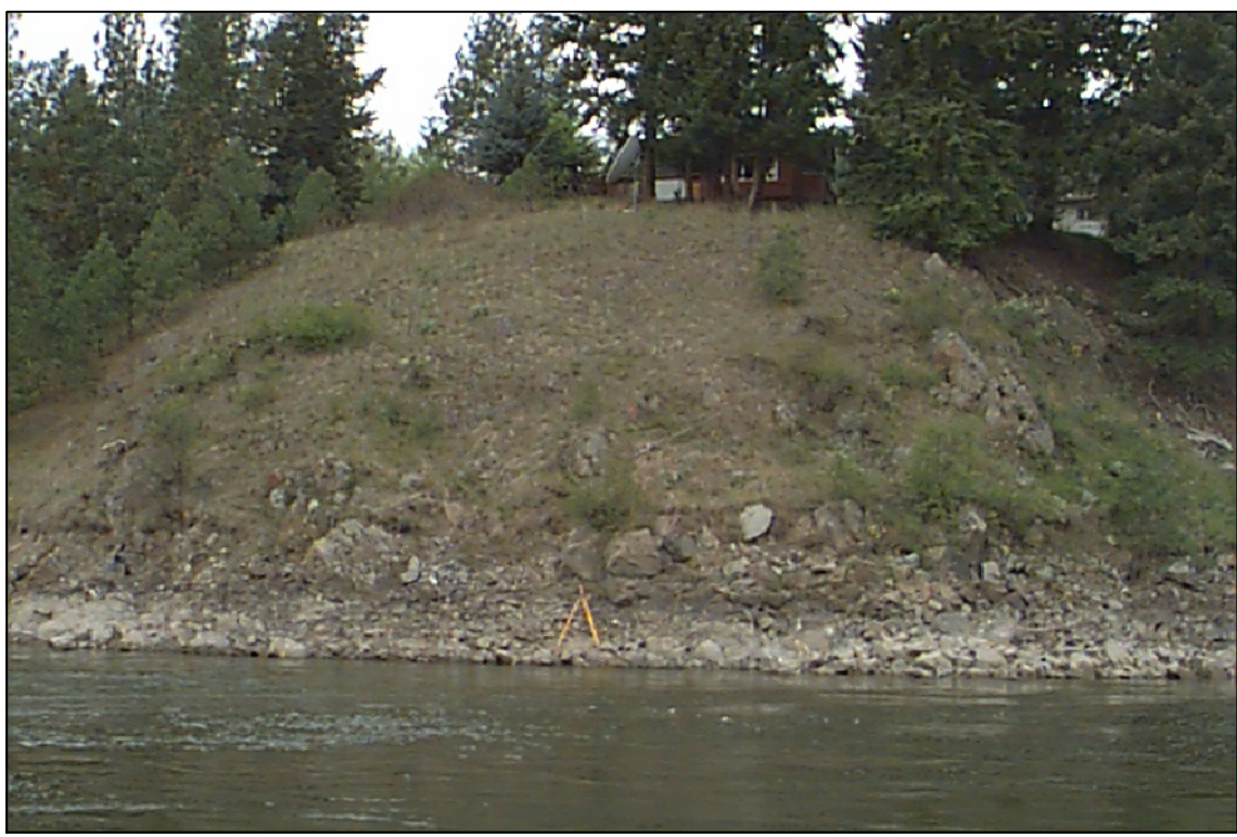
RIGHT BANK VIEW