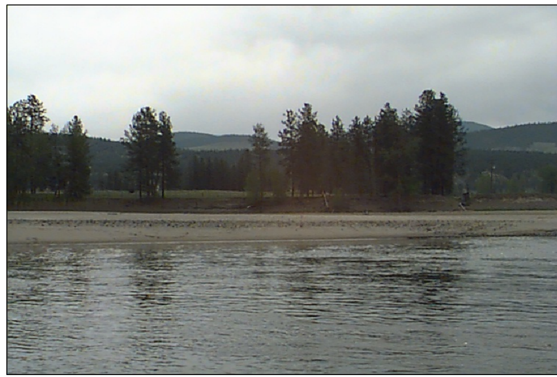
LEFT BANK VIEW